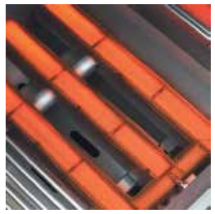
TRIDENT<sup>™</sup> INFRARED BURNER

Our unrelenting attention to detail and our passion for innovation have fostered the stunning features that define the Lynx Professional Series. These features begin with meticulous hand-crafted excellence, and they culminate in powerful capabilities that give you precision control.