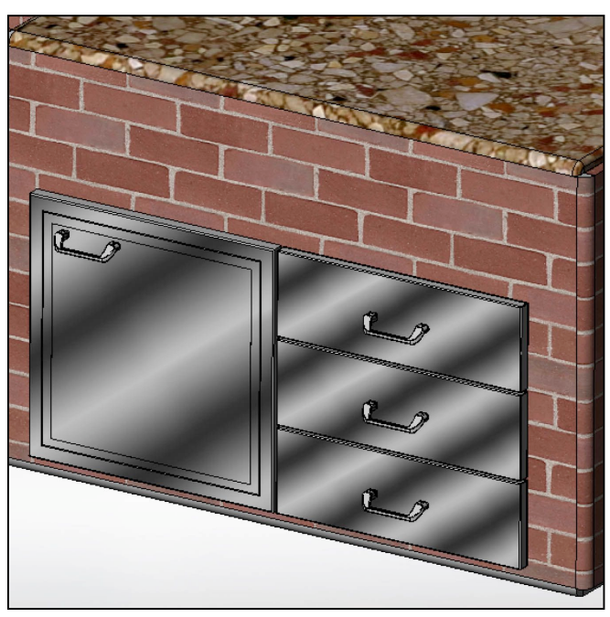
Rendering of Modular Drawer stacked 3-high and paired with a Lynx Access Door.

Rear view of installation details. Red arrows indicate parts that are included with the Modular Drawer Kit (Model LMD-KIT) allowing the individual drawers to be stacked 2 or 3 high.